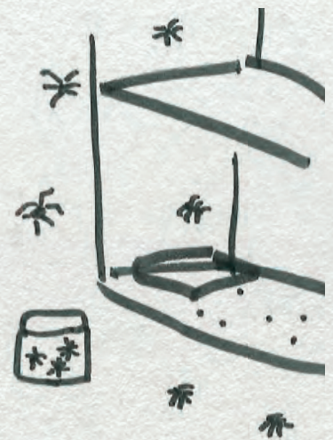
“My mom was so scared, I tried to keep the bugs away from her.”