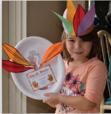
For some kids, the first time they get to celebrate holidays is at Shepherd's Gate.