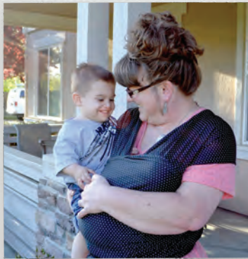
Many of our kids have lived in foster care. Courts work with us to reunite families and help moms live changed lives.