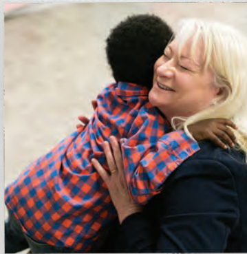
Knowing they are safe and cared for is vital for kids to be able to start healing.