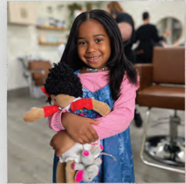
Because of partners like you, kids get everything they need at Shepherd's Gate: meals, clothes and even toys.