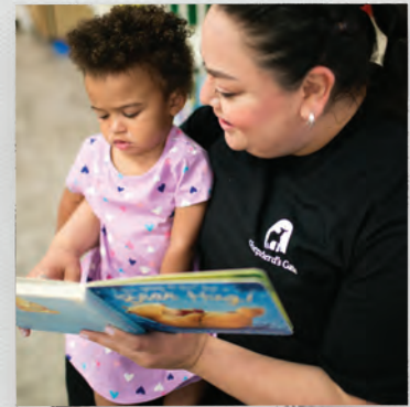
Through Shepherd's Gate, kids get play therapy, outside counseling and childcare while their moms work on their recovery.

The whole child program provides necessary help for all areas of a child's recovery and healing. To find out more about the children's program at Shepherd's Gate, go to: shepherds gate.org/children